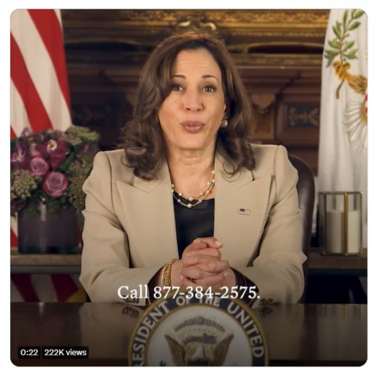
2:45 PM · Jul 21, 2022 · Twitter Media Studio

Thanks to our Bipartisan Infrastructure Law, working families can get $30 per month off their internet bill. and a $100 discount off a laptop, desktop computer, or tablet. To see if you're eligible, visit GetInternet.Gov.